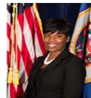
Commissioner Shawntera Hardy

Department of Employment and Economic Development